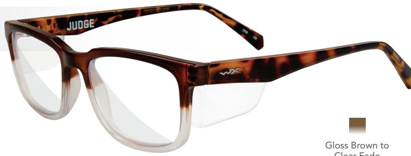
Gloss Brown to Clear Fade