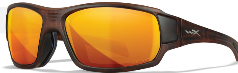
Matte Hickory Brown