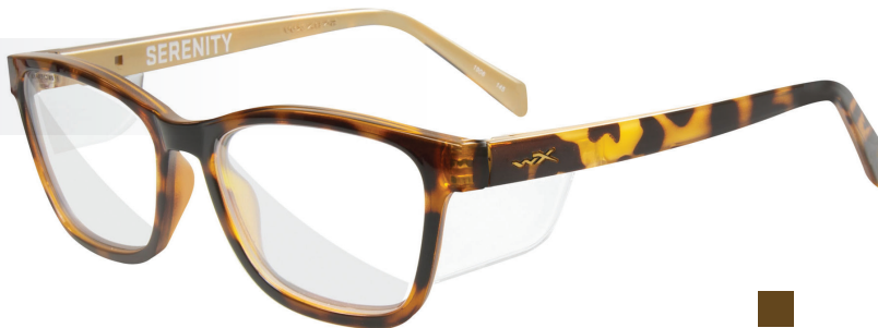
Gloss Brown Demi/ Champagne